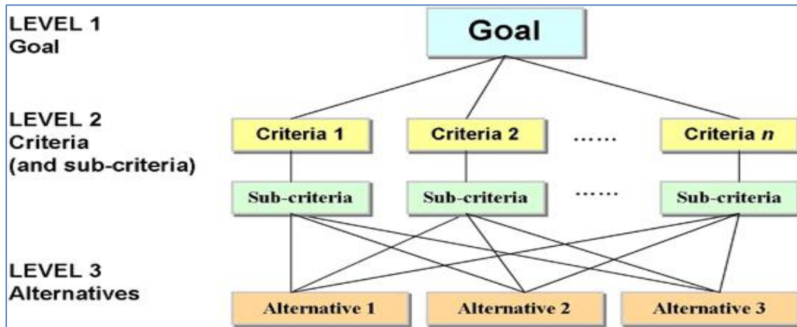
Figure (1) Analytic Hierarchy Process (AHP) model