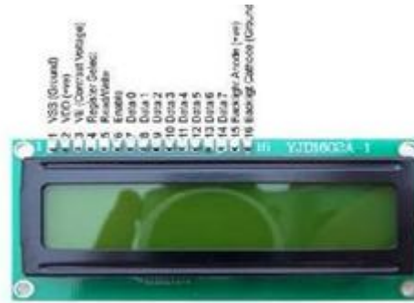
Fig 4. LCD display