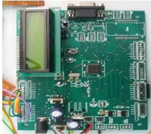
Fig 2. ARM7 LPC2148

A passive infrared sensor (PIR sensor) is an electronic sensor that measures infrared (IR) light radiating from objects in its field of view. They are most often used in PIR-based motion detectors. PIR sensors are incredible, they are flat control and minimal effort, have a wide lens range, and are simple to interface with. A PIR or a Passive Infrared Sensor can be used to detect presence of human beings in its proximity.