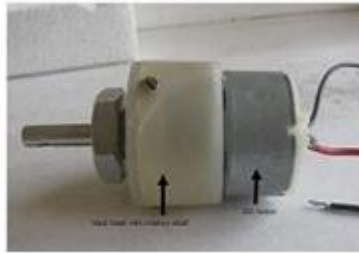
Fig 5. Bi-directional linear DC Motor

Dc motors are increasing in popularity due to their performance advantages over ac motors. Advantages of DC motors include Speed control over a wide range both above and below the rated speed, High starting torque- have a starting torque as high as 500% compared to normal operating torque, Accurate steep less speed with constant torque, Quick starting, stopping, reversing and acceleration, Free from harmonics, reactive power consumption and many factors which makes dc motors more advantageous compared to ac induction motors.