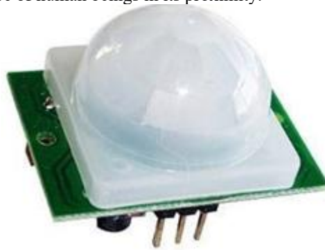
Fig 3. PIR sensor

A passive infrared sensor (PIR sensor) is an electronic sensor that measures infrared (IR) light radiating from objects in its field of view. They are most often used in PIR-based motion detectors. PIR sensors are incredible, they are flat control and minimal effort, have a wide lens range, and are simple to interface with. A PIR or a Passive Infrared Sensor can be used to detect presence of human beings in its proximity.