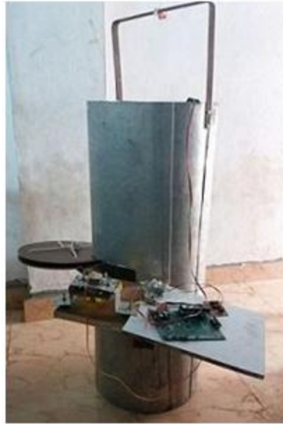
Fig 6. Bore well rescue system