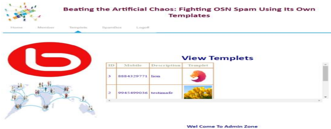
Fig7: View Templates in Admin Zone