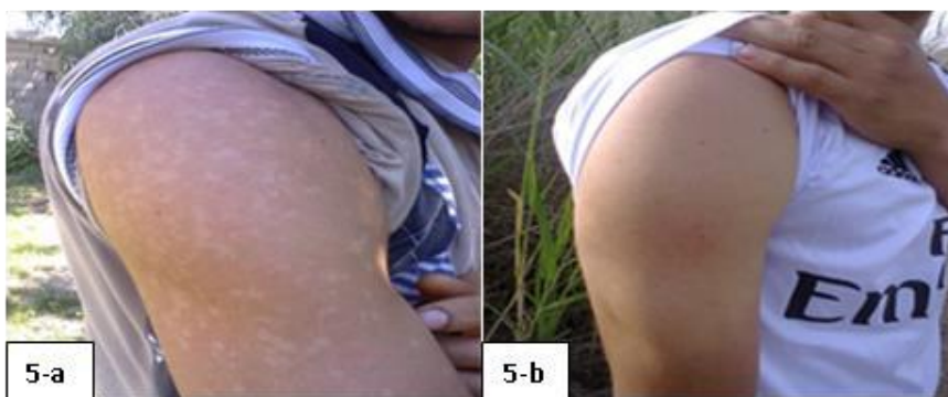
Figure (5): a:- M. furfur lesions in untreated patient appear as white patches in arm b: clearance of the lesion after treatment with C craniiformis suspension locally.