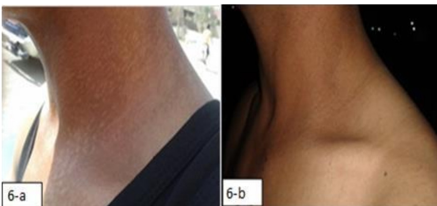
Figure (6) - a:- M. furfur lesion in untreated patient appear as white patches in neck and above sternum region . b: clearance of the lesion after treatment with ivermectin locally.

fluconazole therapy was found to be superior than other topical remedies like clotrimazole in the treatment of PV in terms of efficacy and patient compliance and also cost-effective for the patients 42 , but the efficacy depends on increasing of dose up to 300 mg weekly to be more potent, which is the main drawback due to possible toxicological effects 25,42 .