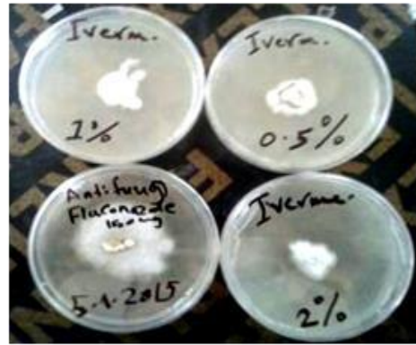
Figure 2: Effects of different concentrations of ivermectin aqueous solution on growth of M. furfur compared with fluconazole 150 mg (sabouraud Dextrose agar).