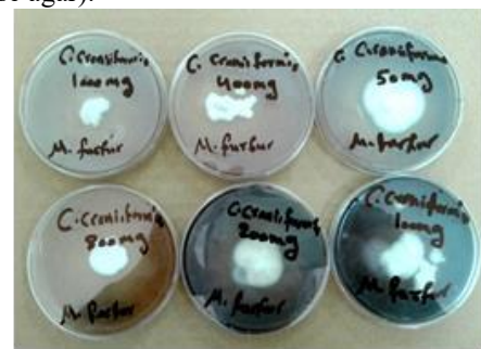
Figure 3: Effects of different concentrations of alcohol extract of C. craniiformis on growth of M. furfur (sabouraud Dextrose agar).

tion from animal sources as a result of direct handling of domestic dogs and birds which include the race pigeons. The main affected area in this study include neck and shoulder, less frequently the trunk and this may attributed to several factors includes but not limited to, humidity and high temperature, hyperhidrosis, familial susceptibility, and immunosuppression 25 . A range of skin microenvironmental factors, such as the bacterial microbiota present, pH, salts, immune responses, cutaneous biochemistry, and physiology, may play a role in adherence and growth of malassezia species, favouring distinct genotypes depending on the geographical area and/or the skin sites 26 , which come in conflicts with others, reported that the trunk represent the main affected sites 20 . The medications used in this study when compared with other studies using other remedies, are cheap, available, easily intake and safe. The medications previously used in treatment of PV include azole compounds 27 . The present study disclosed that alcoholic extract of C. craniiformis (1000 mg) was effective in 90% of PV cases, which respond to treatment and the meantime for clearance was 24days. Aqueous solution of ivermectin (2 %) was effective in (75%) of PV with meantime for clearance was 23.5 days. In control group, (70%) patients respond to treatment with fluconazole (150mg), and the meantime for clearance was 41days.